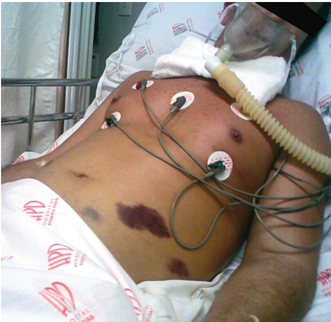
FIGURE 1 - Petechial hemorrhagic suffusion, on the thorax and abdomen of a patient with Plasmodium vivax malaria.

carvedilol and was maintained in negative fluid balance. A thick blood smear was negative to Plasmodium sp to day 5, and after 12 days of treatment, he was discharged (February, 11 th , 2009) in regular health and administered carvedilol (1 tablet, 2 times/day).