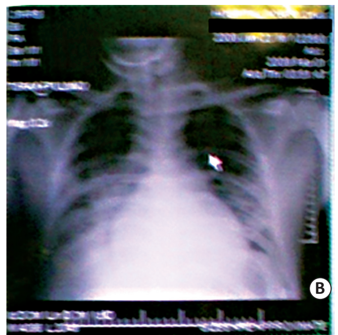
FIGURES 2A and 2B - Chest radiography showing cardiomegaly and acute edema of the lung in a patient with Plasmodium vivax malaria.

in addition to the first P. vivax malaria episode in six patients who presented with cardiac involvement (from a series of 22 malaria cases admitted in a German hospital) 2 . Similarly a case of myocarditis associated with primary P. vivax malaria has been reported in a woman from South Korea 3 . Though these primary cases were related to the absence of specific immunity to the parasite, severe cases, including cardiac damage, may occur in patients with previous malaria who have some degree